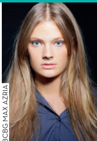
BCBG MAX AZRIA